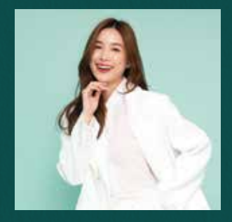
BUSINESS AND SOCIAL SCIENCES

The Management Development Institute of Singapore provides an immersion programme for visiting students in our integrated campus, located in the heart of Singapore at Stirling Road! The multi-disciplinary immersion programme is developed and delivered by MDIS faculty and can be customised accordingly to your learning needs.