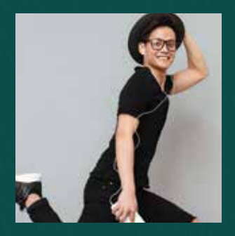
FASHION AND DESIGN