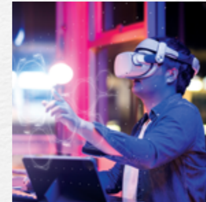
Creativity & Innovation