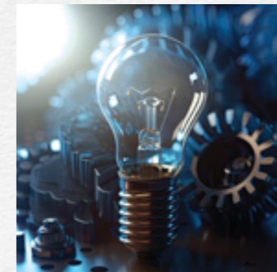
Personal Effectiveness & Productivity