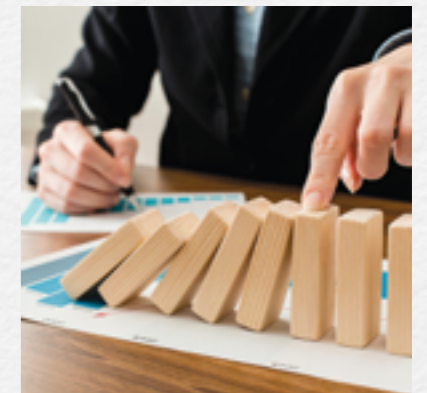
Risk Management / ChatGPT