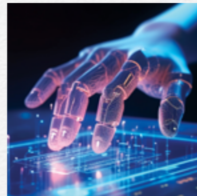
IT Short Courses