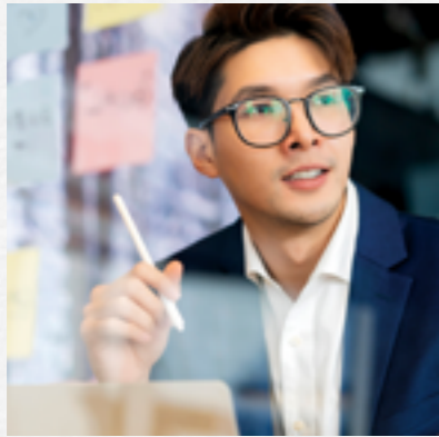
Business Management / Sustainability