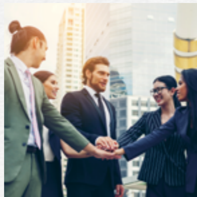
Human Capital Management